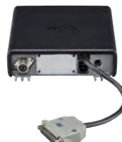
Optional OPC-2078 installation image